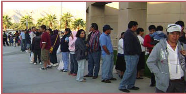
One of many Patients lines at Oasis LMV Clinic